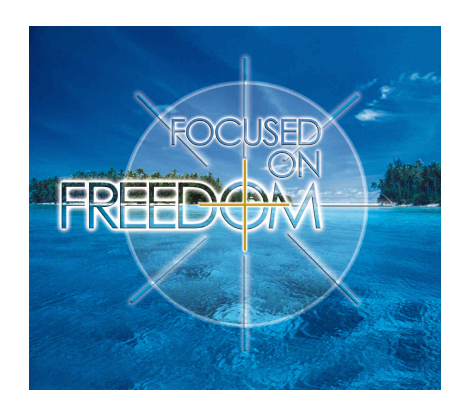
Mexico City, Mexico